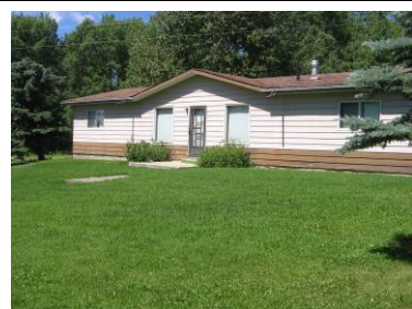
Rundle's Mission Guest House

This is an exciting time at Rundle's Mission. It is a time of renewal and a time of improvement to our services. Our wish is for all people to have the ability to experience this truly unique part of Alberta.