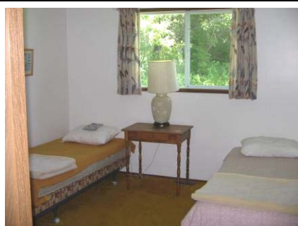
Guest House Bedroom

We are reaching our goals and it is thanks to our many supporters and the Alberta Government CFEP Grant of $52,000.00 that we have commenced renovating House #1 March 1, 2009. With volunteer time and your donations we were able to match this grant to complete Phase One of the House Accessibility Project .